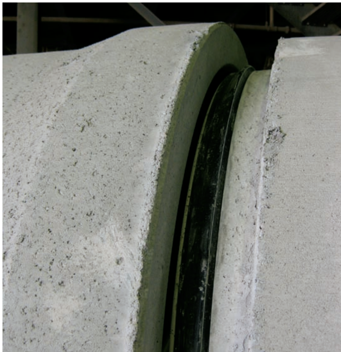
Concrete pipe joint with rubber gasket

PURPOSE: The obvious...it's not what the owner paid for. A leak in a sewer pipe is an opportunity for groundwater to infiltrate into the sewer system, or, for sewer flow to exfiltrate from the pipe into the ground. A quality pipe with watertight joints will provide the desired performance. Reinforced concrete pipe (RCP)