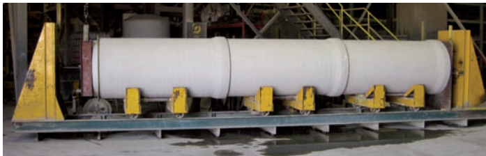
Hydrostatic test of concrete pipe

The PPP was first established in 1965 by Ontario Water Resources Commission (OWRC) and OCPA, and has evolved with different regulating bodies, including the Ministry of Environment, and the Ontario Clean Water Agency. Today, the PPP utilizes an Advisory Committee represented by: Municipal Engineers Association (MEA), Ministry of Transportation (MTO), Ontario Provincial Standards (OPS), Concrete Precasters Association of Ontario (CPA), and the OCPA. The Advisory Committee is responsible for administering the PPP and in turn used to prequalify plants, manufacturers and products of the precast concrete drainage products industry.