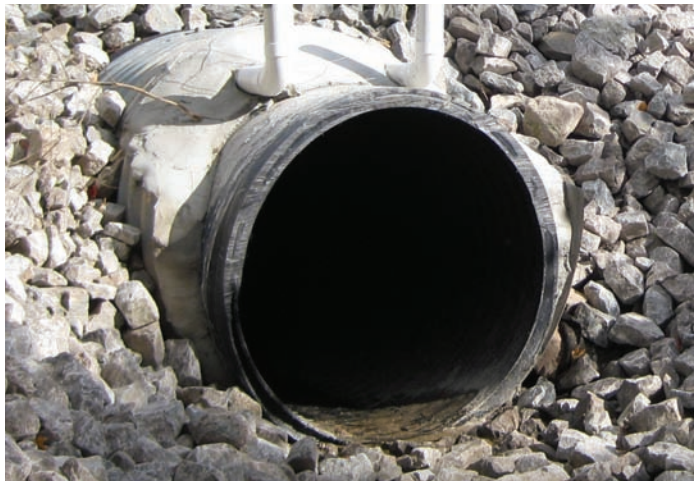
Relined culvert - reduced cross sectional area. This CSP culvert under Highway 407 in Ontario was relined after less than 20 years in service. The designer specified the appropriate rip rap protection to prevent erosion.

The following statement is made in a research paper that was presented at both the Transportation Association of Canada Annual Conference in Halifax in September 2010, and again at the Transportation Research Board Annual Meeting in Washington D.C. in January 2011.